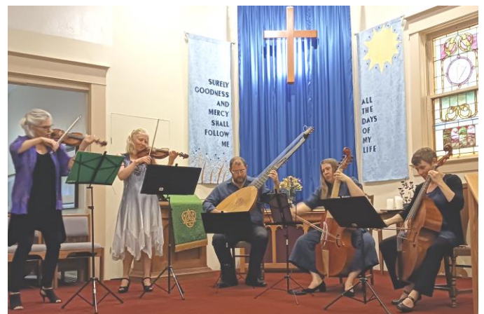
Baroque Montana concert on June 17, 2022

-Luke 11:2b-4, First Nations Version: An Indigenous Translation of the New Testament