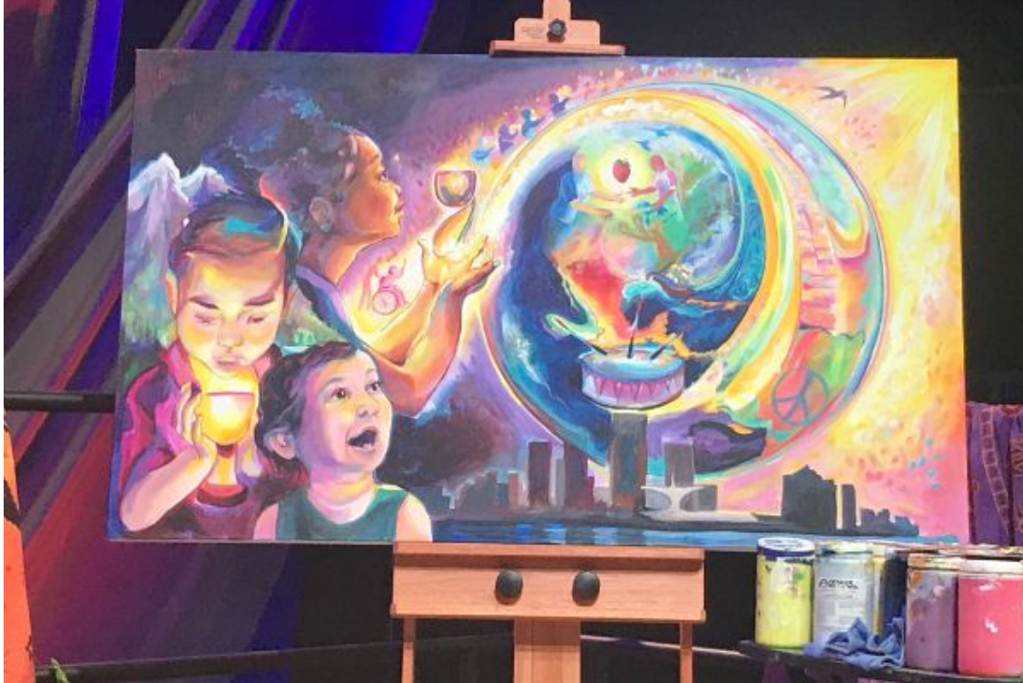
An artist's representation of our first day of synod plenary sessions.